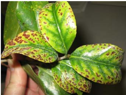
Manganese deficiency in Camellia

See the newsletter in color at: http://cfextension.ifas.ufl.edu