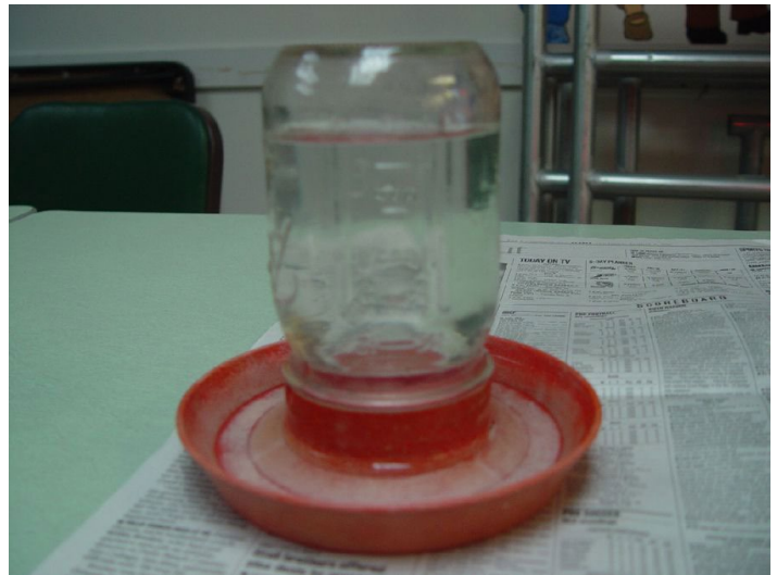
Figure 3. Chick water fountain

Chicks can survive up to two or three days without eating or drinking right after hatching because they are able to utilize the nutrients remaining in their retained yolk sac during this time. This is how hatcheries can ship chicks all over the country with little or no mortality. When chicks arrive, they will be thirsty. It is extremely important to make sure each chick gets a good drink of water upon arrival. Water should be available to chicks at all times. It is optional to add \frac{1}{4} to \frac{1}{2} cup of sugar to one gallon of water to give chicks upon arrival to boost the chicks energy level if they appear lethargic. Also one teaspoon of antibiotic powder specially labeled for chicks and available at most feed stores can be added to water if the chicks appear unthrifty upon arrival. As chicks are removed from the shipping box, dip their beaks in the water to encourage them to drink (see figure 3).