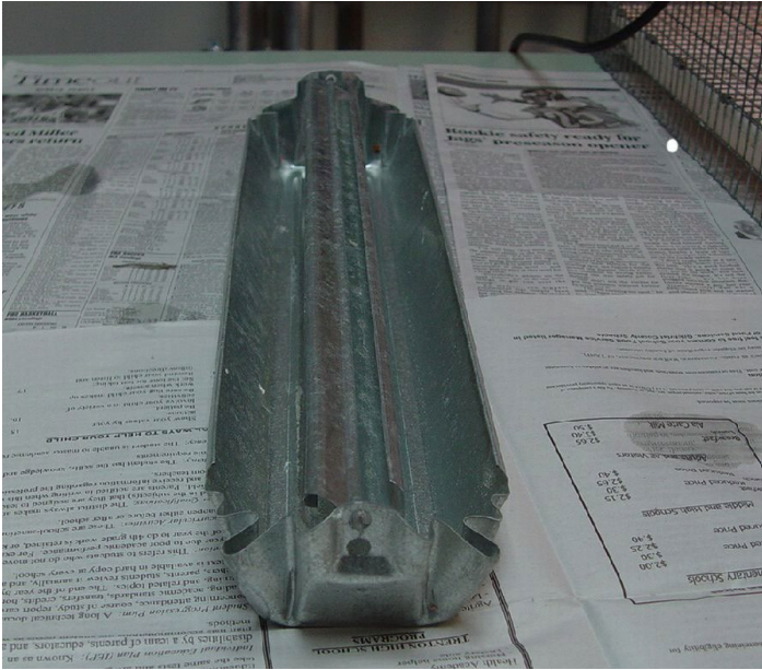
Figure 4. Chick feeder

are usually medicated. Do not feed three-grain scratch or ground corn. Chicks need more protein, vitamins, and minerals than these feeds can provide. Feed a good commercial chick starter for the first 6-8 weeks. Then switch to a chicken grower feed from 9-20 weeks. At 20 weeks of age switch chickens to a laying feed, such as laying crumbles or mash. Separate roosters and hens at this time if the goal is a home laying flock.