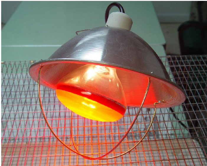
Figure 2. Heat lamp

comfortable temperature, the chicks will move about freely throughout the available space.